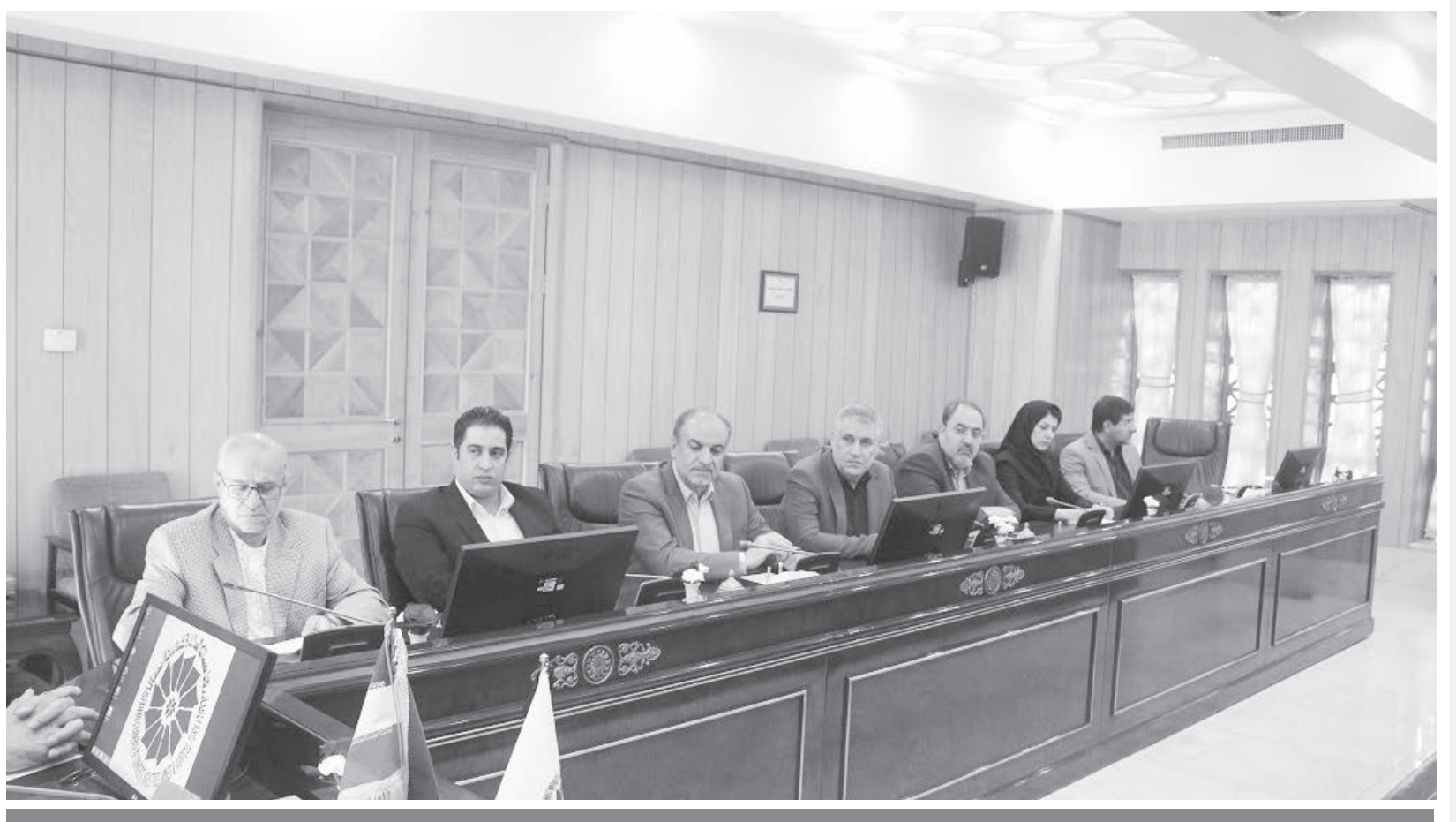
معاون اقتصادی وزیر امور خارجه: