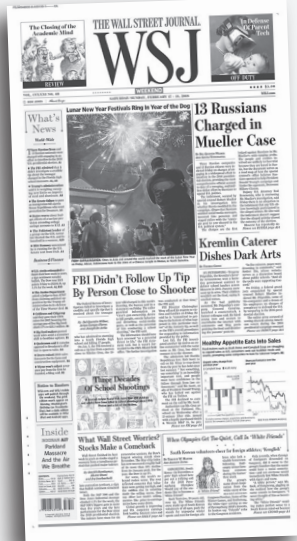
◆ 13 Russians charged in Mueller case