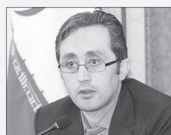
on raising money by issuing debt to cover widening budget deficits while showing no signs of cutting expenditures.

trillion rials ($2 billion) of Islamic Treasury Bills by the fiscal year end. The next fiscal year's ceiling on bond issuance by the government, ministries, universities and municipalities is 1.78 quadrillion rials (about $38.86 billion), the Majlis Joint Commission approved, according to Financial Tribune. Lawmakers expressed concerns that the government is becoming increasingly dependent