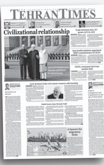
◆ Civilizational relationship