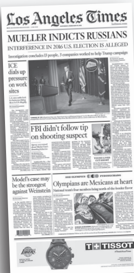
◆ Mueller indicts Russians