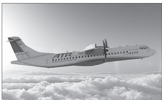
An Aseman Airlines flight with 65 passengers on board crashed near Samirom, Isfahan province, on Sunday morning.

The 20-year-old ATR plane carrying dozens of passengers from Tehran to Yasuj, in southwestern Iran and the capital of Kohgiluyeh and Boyer-Ahmad province, after disappearing from flight radar on Sunday morning, went down in Samirom, Isfahan province. Several helicopters have been deployed to search the crash site near Padena mountain, and search and rescue operation is underway. There is no immediate details over the casualties. A spokesman for the Iranian emergency organization said it was not possible to send ambulances to the mountainous area, but choppers are being deployed.