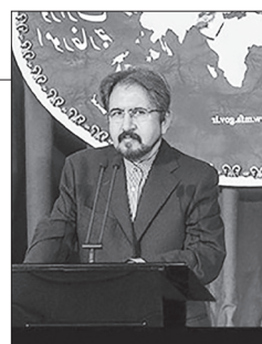
Spokesman Raps US Push to Hamper Investment in Iran