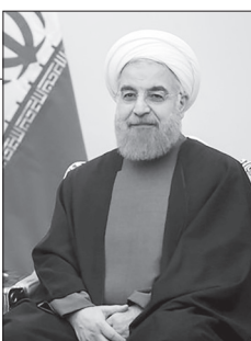
All Iranians must strive to build more prosperous Iranian