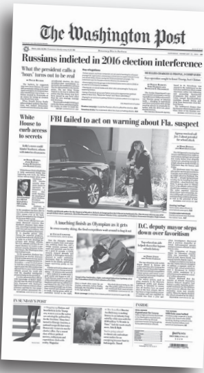
◆ Russian indicted in 2016 election interference