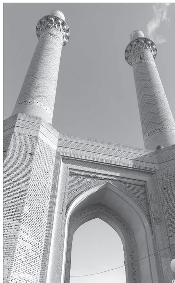
▲ Daroziafe minarets are two historical minarets in Isfahan, Iran. The minarets are located in the old Jouybareh district on the Ibn-e-Sina street. These 14th-century minarets are built on the both sides of a portal. There is an inscription in white script on the ultramarine background under the above muqarnas. Only three Arabic words have remained, which mean someone, who enters.