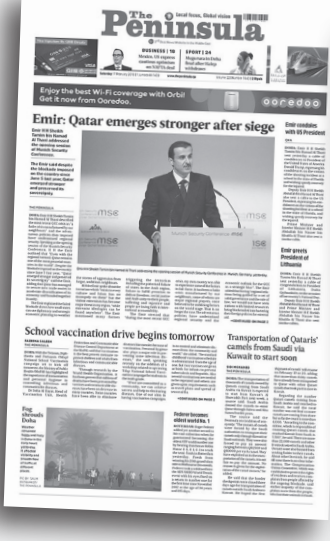
◆ Emir: Qatar emerges stronger after siege