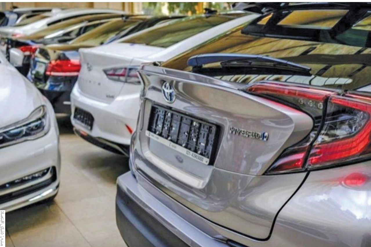
اخبار اصفهان بررسی می‌کند؛