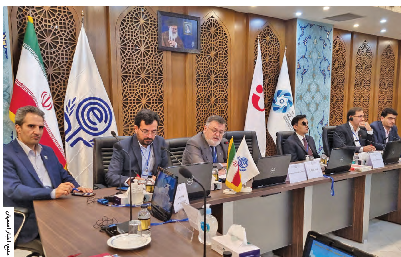
میچ: اخبار اصفهان

معاون دبیر کل آکو مستقر در ایران مطرح کرد: